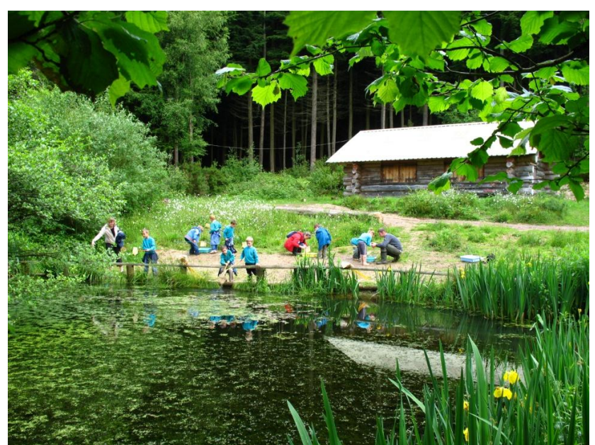
Dragonfly Pond supports a huge diversity of plant and animal life and is an ideal location for school children to undertake hands-on studies of freshwater ecology.

January 2012 sees the launch of a major new two-year initiative by the Offwell Woodland & Wildlife Trust for which it has been awarded a grant of £41,400 from the Heritage Lottery Fund. "Discovering Bishop Copleston's Wetland Heritage" will focus on the conservation of freshwater wetland habitats rich in biodiversity at the Woodland Education Centre, which have evolved from features created within a Victorian pleasure garden. The scheme will also provide education about the richness of the habitat, identification of the many species present and the way in which the water systems are managed to optimise water flow and levels using the Victorian sluice and leat system.