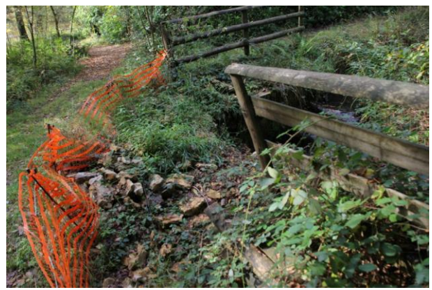
The broken culvert in the Victorian leat which will be repaired.

The project will attract a wide range of volunteer participation from school children and adults of any age and ability. Part of the initiative will see the removal of large amounts of silt from one of the Centre's ponds, and repairs to a broken culvert forming an essential part of the floodwater leat bypass system.