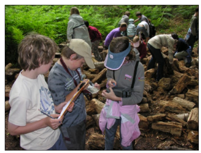
Using Q3 Rangers to identify invertebrates in a log pile.

Many of the school groups visiting this summer have participated in the Woodland Discovery Trail (outlined in the last Centre News) using the new hand-held Q3 Ranger computers. This has proved to be extremely effective as a learning activity, as well as very enjoyable for the children.