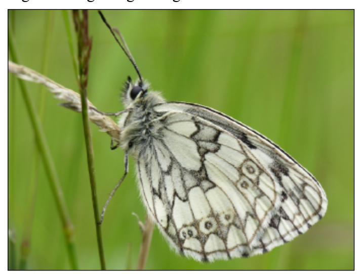
Marbled White butterfly perched on grass, sunbathing.

Marbled Whites have an interesting life cycle, with the caterpillars feeding on a succession of different grasses as they grow. Section 8, which is cut in the autumn, is one of the grassier strips on the heathland. It is therefore no surprise that the Marbled Whites concentrate in this strip. Although the male and female butterflies are quite hard to tell apart, with only slight colour differences between them, you can usually pick out the females flying about, dropping their eggs randomly in amongst the vegetation. As soon as the eggs hatch, the caterpillar goes into hibernation, only reappearing the following spring to begin feeding and growing.